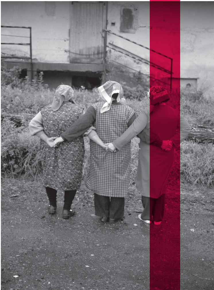
Lucia Nimcova Milkmaids , from the project Unofficial , color print, 2007, 60 x 80 cm

Presented as part of The Temporary Stedelijk at the Stedelijk Museum 28 August 2010 – 9 January 2011